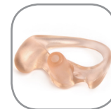
Flexible Ear Insert