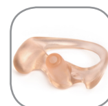
Flexible Ear Insert